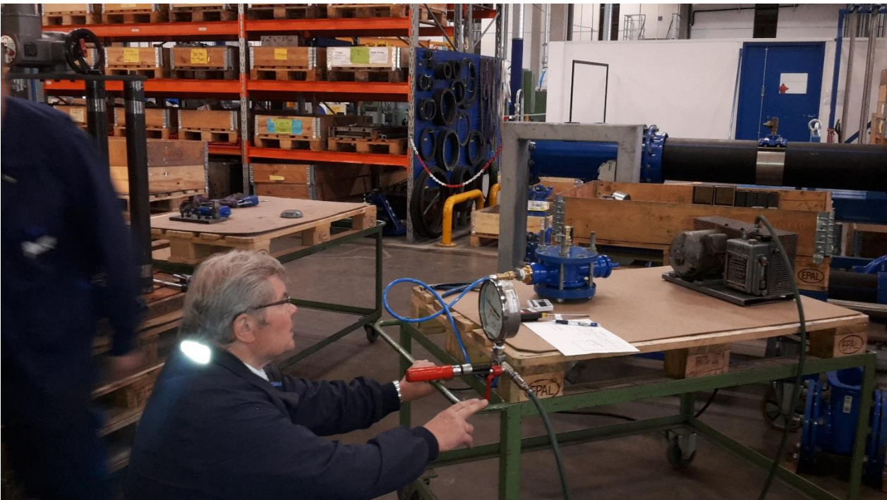
DTI inspection during vacuum test.