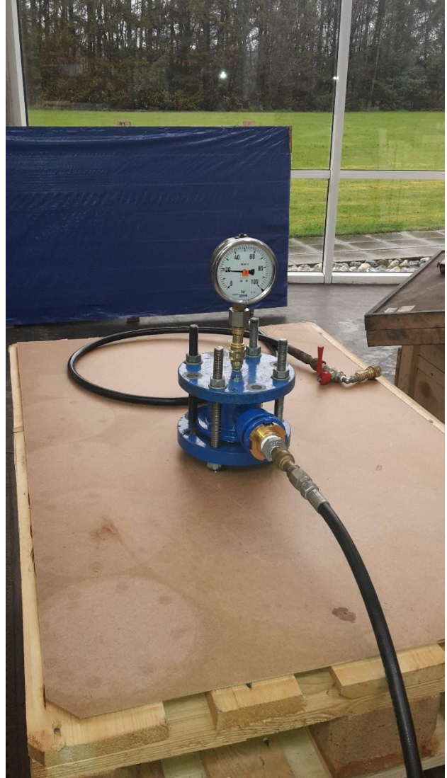
24.000 cycle test 9 Bar (low) to 18 Bar (high) pressure with 5 sec. hold time. Data logged in PLC for verification of pressure, time and number of cycles.