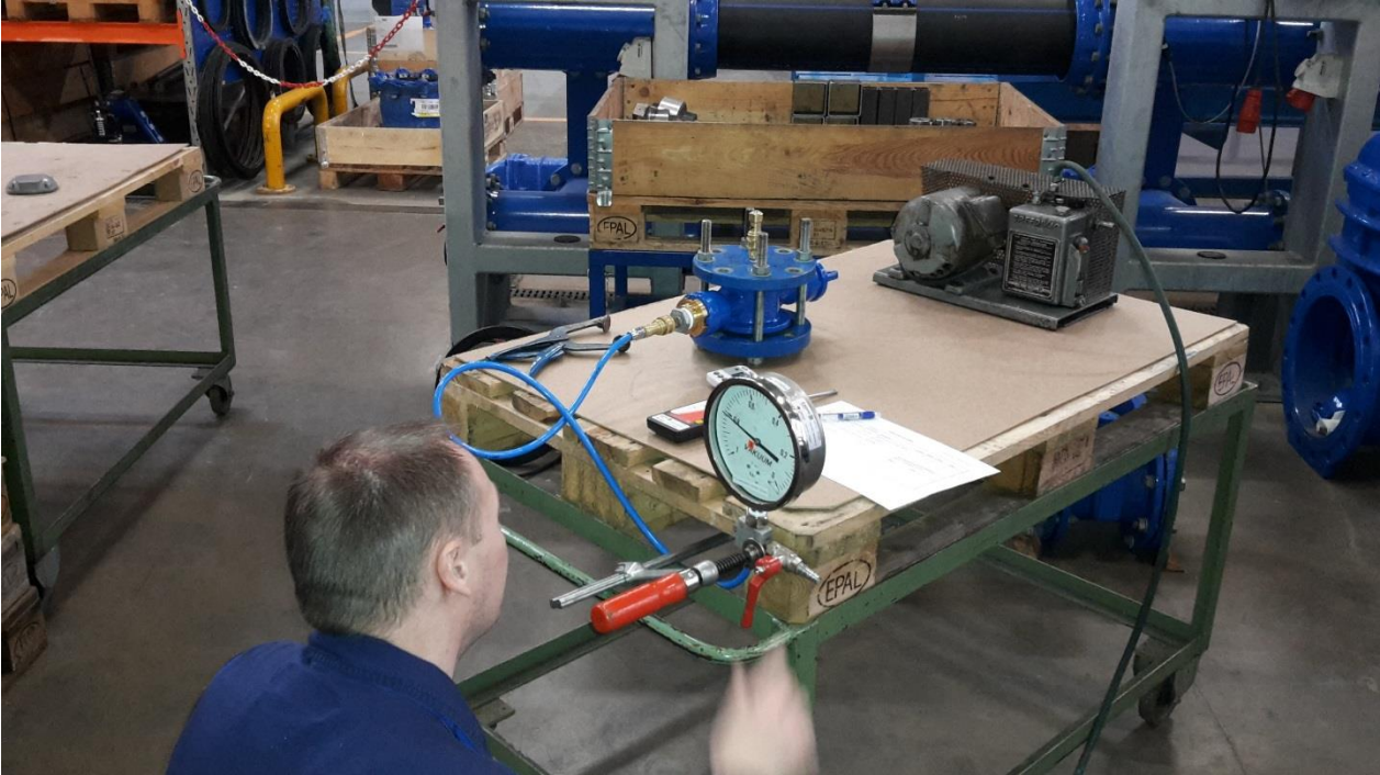
Vacuum test start.

Supa Lock™ DN32 prototype tests according to 04.063 Qualification Test Report Test Sheet rev.3, performed to prove function.