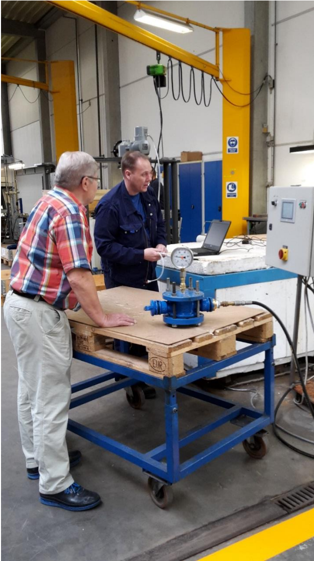
DTI verifies test set-up and data logging.