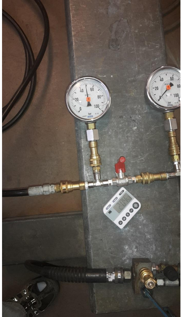
48 bar / 2 hour test.